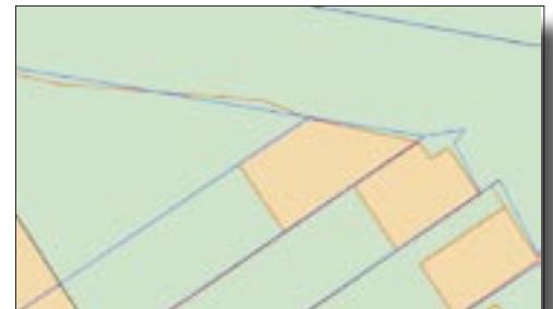
LBE's polygons (shown in blue opposite) were supposed to line up with the OS MasterMap data (orange and red), but there were frequent differences. Data courtesy of Ordnance Survey GB © Crown Copyright

By utilising 1Spatial's Radius Topology, LBE expects 100% clean and structured data in little more than 23 weeks, reducing their original estimate by almost 5 years!